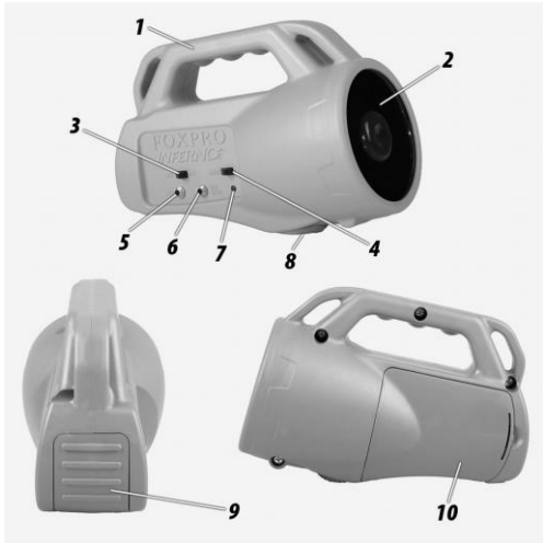
Table 1: Inferno Overview

The images below, and their corresponding charts, highlight notable elements of the Inferno game call and remote.